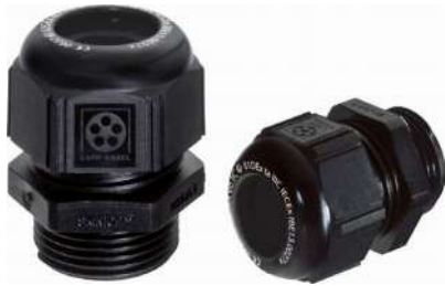
SKINTOP® K-M ATEX plus