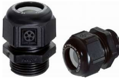
SKINTOP® KR-M ATEX plus