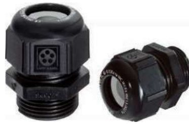
SKINTOP® KR-M ATEX plus