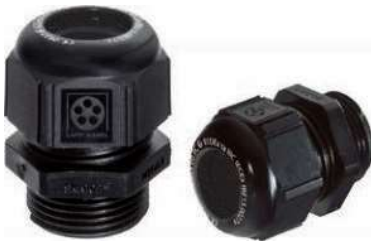
SKINTOP® K-M ATEX plus