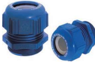
SKINTOP® KR-M ATEX plus blue