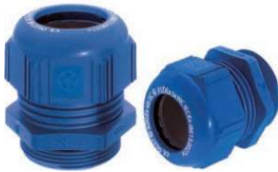
SKINTOP® K-M ATEX plus blue