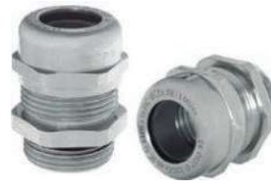
SKINTOP® MS-M ATEX