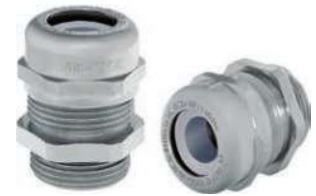
SKINTOP® MSR-M ATEX